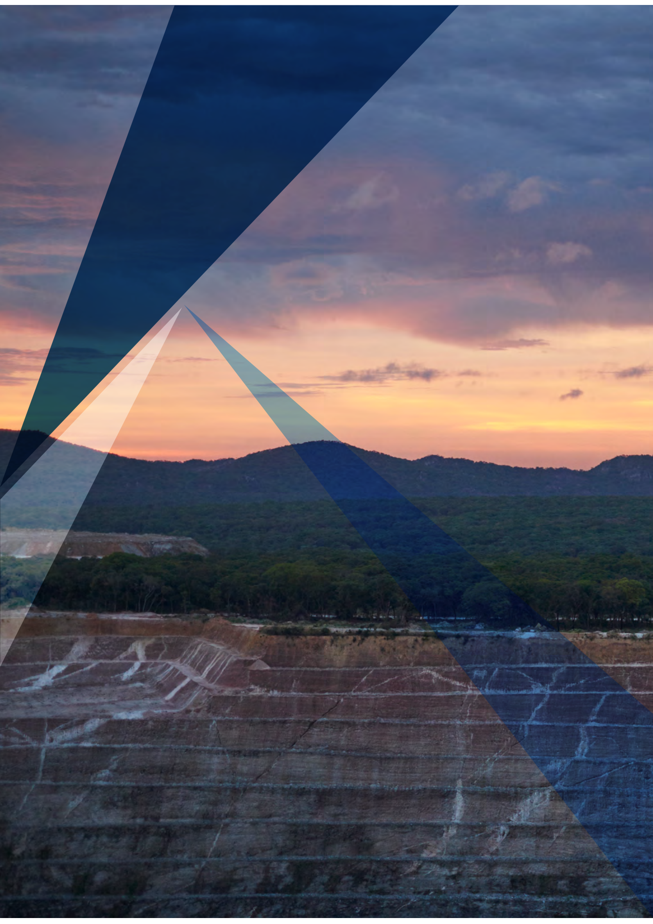
Above Kagem mine in Zambia.

Cover images, from left to right Silicate and UG2 milling sections at the Pilanesberg Platinum Mine. Fabergé egg earrings from the Heritage collection. Aerial view of the Tshipi mine site.